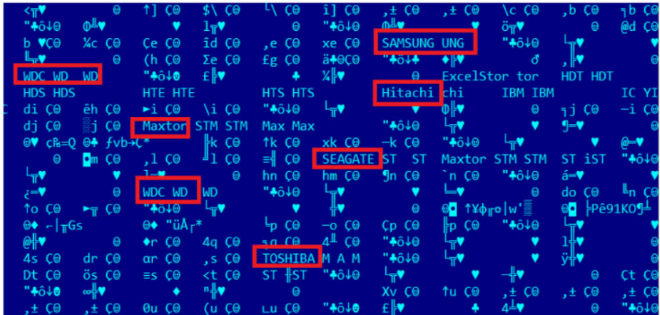
Plugin version 4 infection “capabilities” table

The plugin version 4 is more complex and can reprogram 12 drive “categories”.